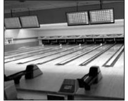
Robin Hood Lanes

Robin Hood Lanes has also gone to the new 42" monitors as well as doing a complete resurface of the 17 year old wood lanes. From what I've heard it almost looks brand new. Exciting stuff for the league bowlers in the fall.