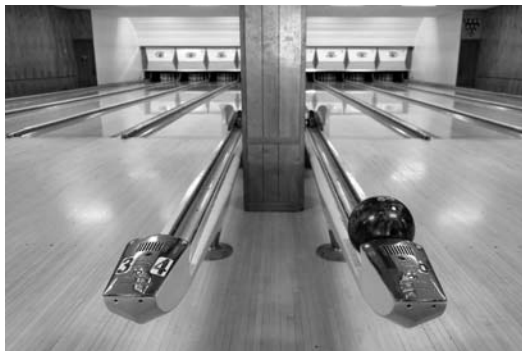
Saratoga Lanes, Maplewood

Celebrating its 99th anniversary this year, Saratoga Lanes has long boasted the title of oldest, continuously-operating bowling center west of the Mississippi. (At least one other facility, the private Denver Athletic Club, disputes that claim with lanes dating back to 1892.) If you're looking strictly at centers that are open to the