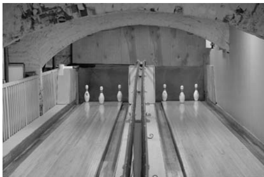
The Corner Bar, St. Charles

public, Saratoga appears to be the clear winner.